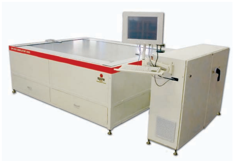
High accuracy and throughput: 240 modules/hour

The Spi-Sun Simulator is available with the Module QA Tester. This integrated automation system allows for efficient module alignment, transport, probing and testing. The Module QA option adds high voltage isolation and ground continuity testing, automatic labeling of modules, and automated load and unload of modules.